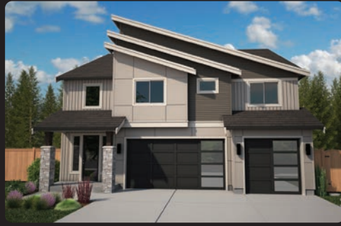
Elevation B - MODERN