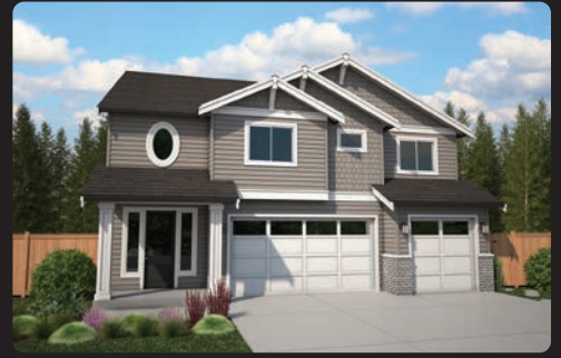
Elevation C - TRADITIONAL