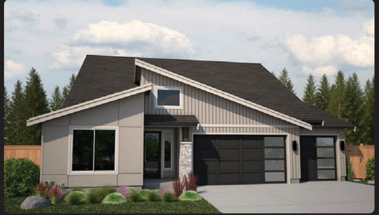
Elevation B - MODERN