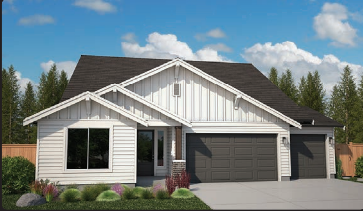
Elevation A - NW FARMHOUSE

3 Beds includes a Guest Suite, Office, Den or 4th Bed | Loft | 2.75 Baths | 3 Car