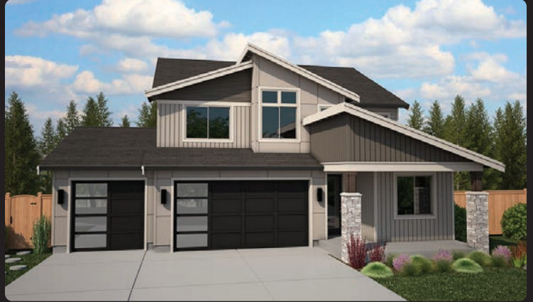
Elevation A - NW FARMHOUSE