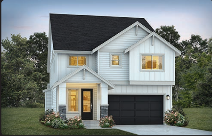
Elevation A - NW FARMHOUSE

4 Beds / Leisure Loft / 2.5 Baths / 2 Car Garage + Shop