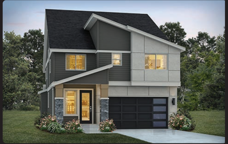
Elevation B - MODERN