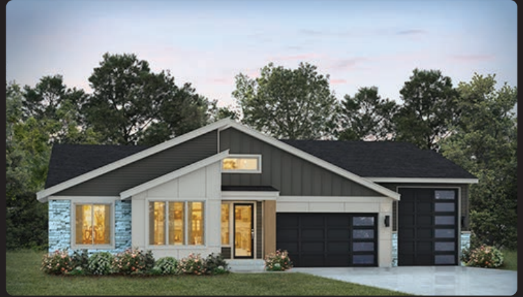
Elevation B - MODERN