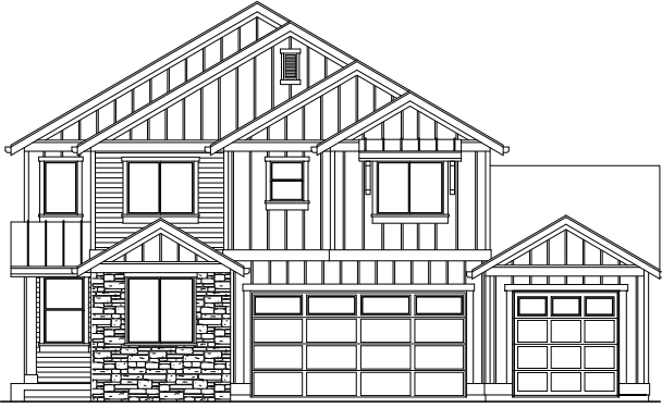
Elevation A - NW FARMHOUSE

4 Beds plus Den or Guest Bed on Main / Office / Leisure Loft / 2.75 Baths / 3 Car