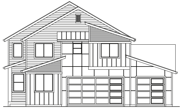
Elevation B - MODERN