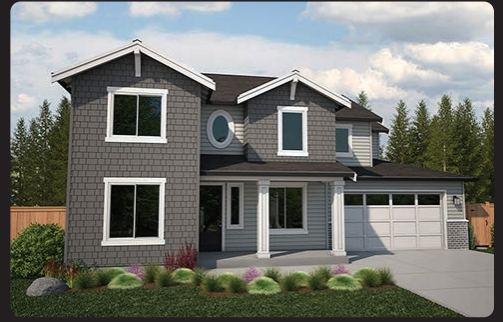
Elevation C - TRADITIONAL