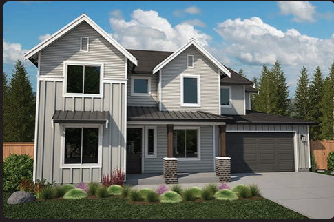
Elevation A - NW-FARMHOUSE

5 Bedrooms Includes Guest Suite on Main, Loft, 2.75 Baths, 3 Car Tandem Garage