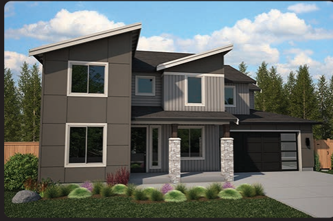
Elevation B - MODERN