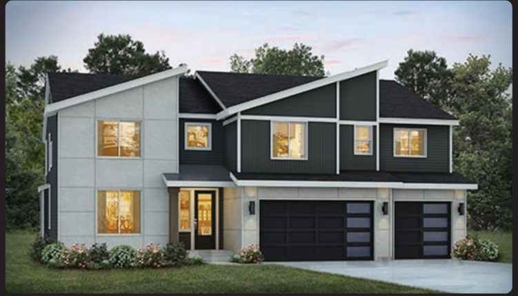
Elevation B - MODERN