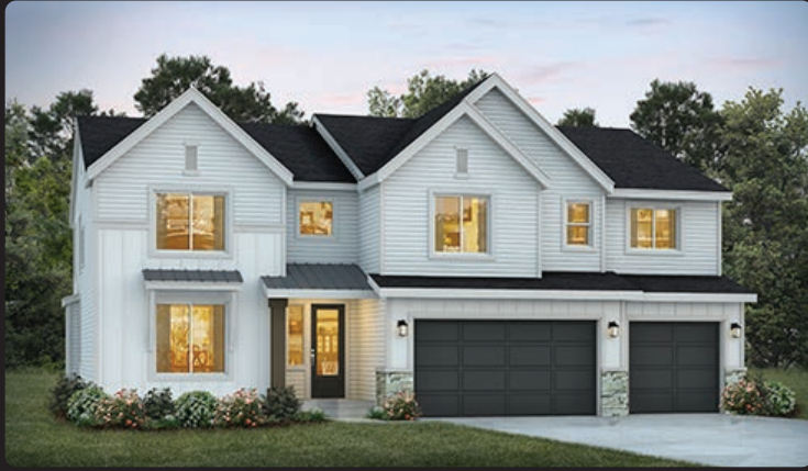
Elevation A - NW FARMHOUSE

4 Beds plus Guest (5th) Bed or Office | Bonus Loft | 2.75 Baths | 3 Car Garage