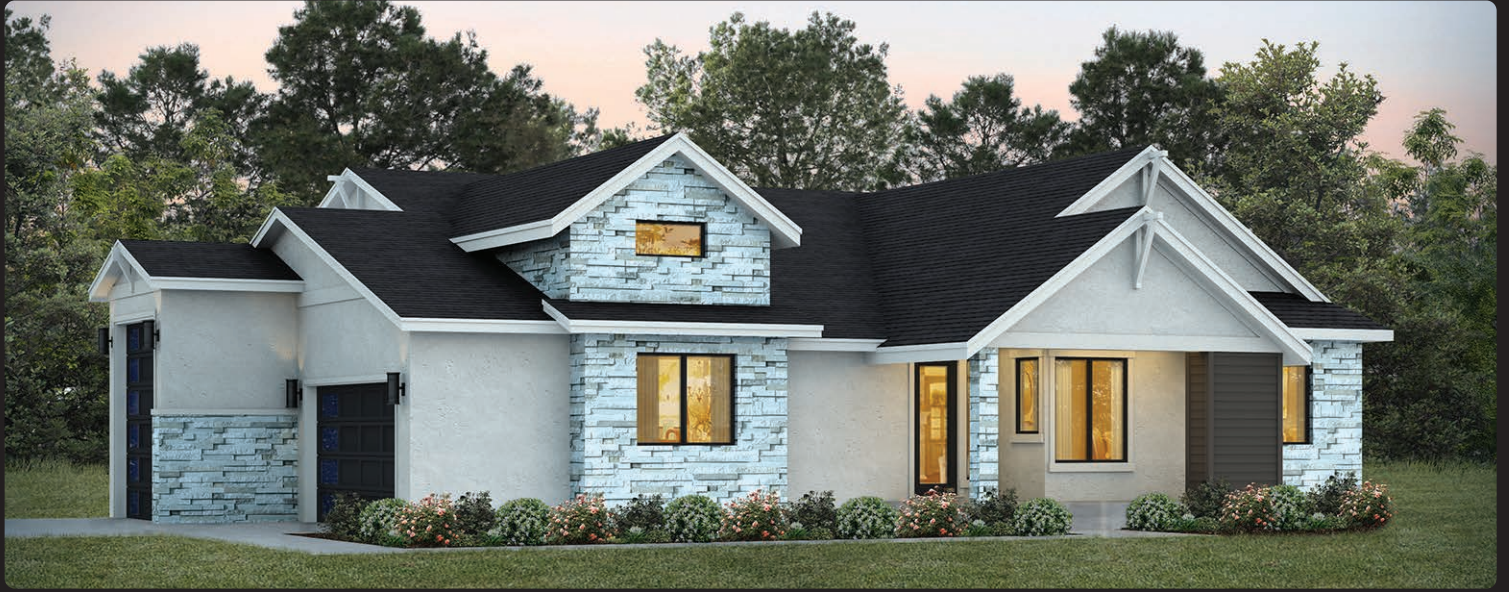
Elevation B - MODERN

3 Beds Includes / Office / 2.75 Baths / 2 Car + RV Garage