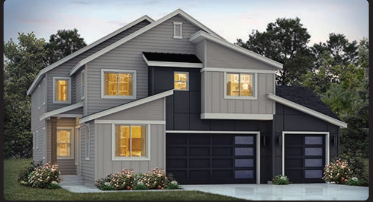
Elevation B - MODERN