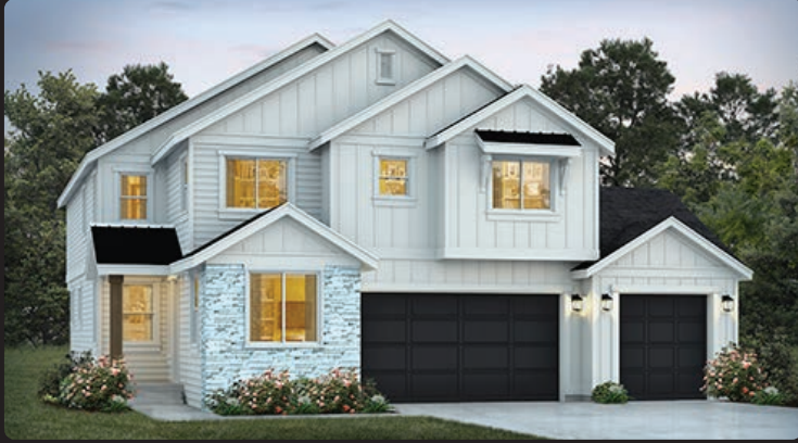
Elevation A - NW FARMHOUSE

4 Beds plus Den or Guest Bed on Main / Office / Leisure Loft / 2.75 Baths / 3 Car