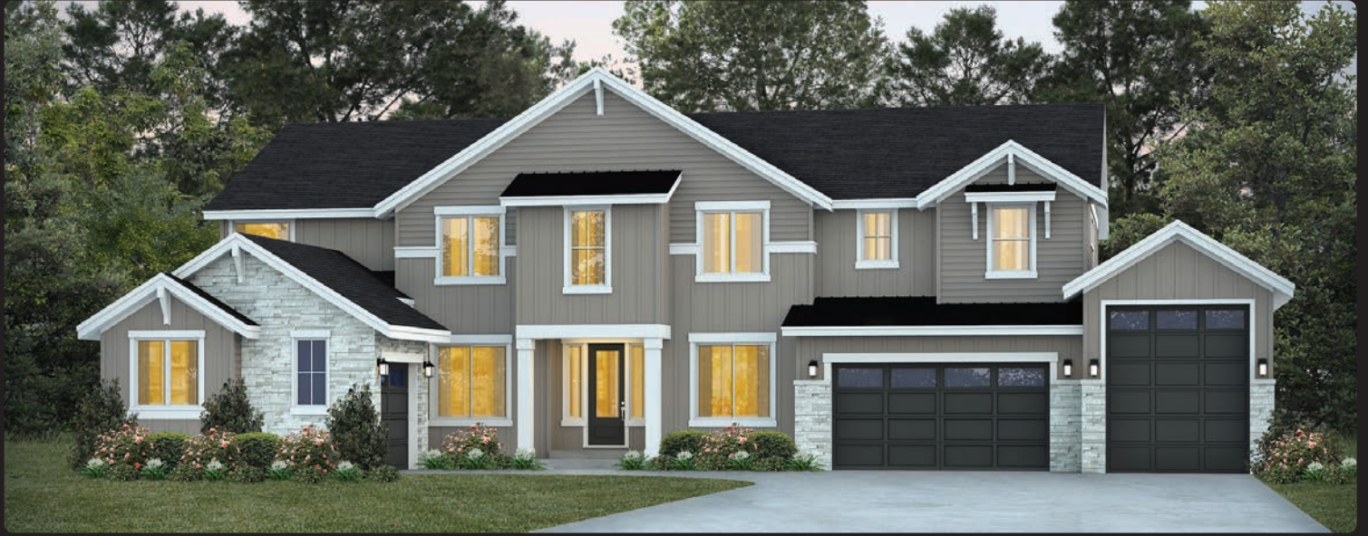
Elevation A - FARMHOUSE

5 Beds Includes Multi-Gen Suite, Guest Suite / Bonus Loft / Office / 3.75 Baths / 3 Tandem Car + RV Garage and Multi-Gen Garage