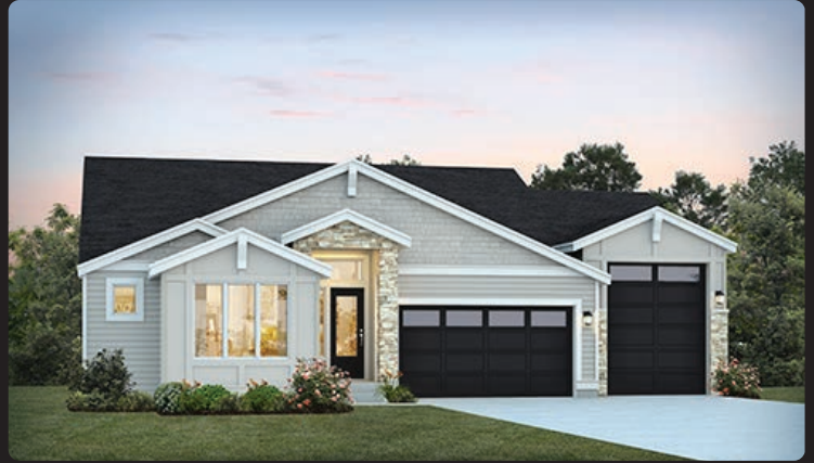
Elevation C - MODERN