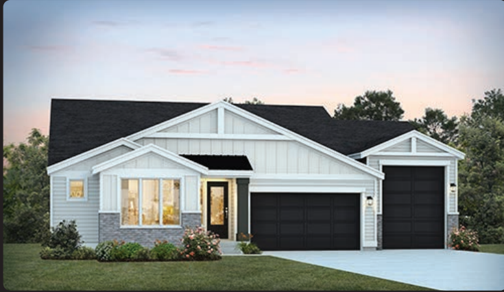
Elevation A - NW FARMHOUSE

3 Beds Includes Guest Suite on Main / Loft / Den / 3 Baths / 2 Car + RV Garage