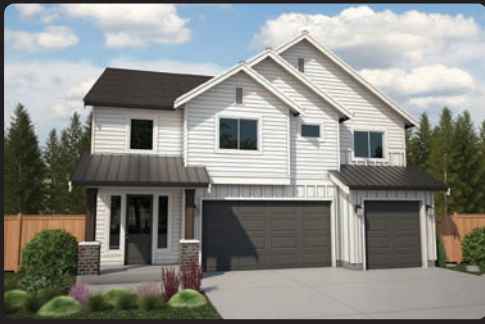
Elevation A - NW FARMHOUSE

4 Beds plus Guest (5th) Bed or Den | Media Room | Leisure Loft | 2.75 Baths | 3 Car Garage