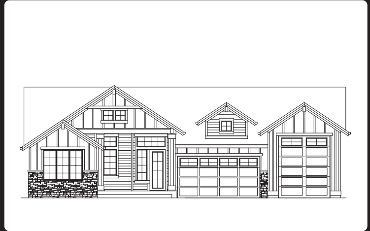
Elevation C - MODERN