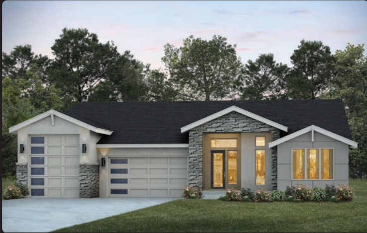
Elevation B - MODERN

3 Bedrooms | Den / Flex Space | 2.5 Baths | 2 Car + RV Garage