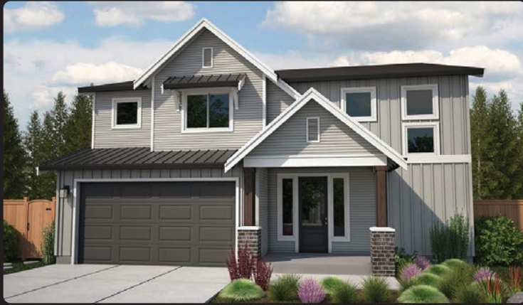
Elevation A - NW FARMHOUSE

4 Beds Includes a Guest Suite / Master on Main / Den or Office / Media Room / Loft / 3.25 Baths / 3 Car Tandem