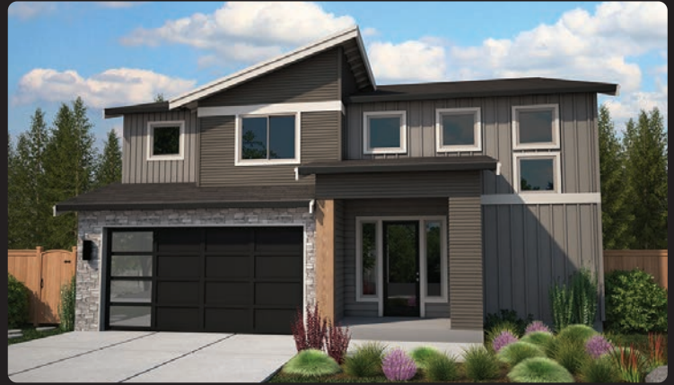
Elevation B - MODERN