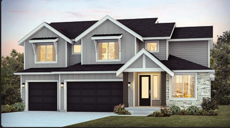
Elevation A - NW FARMHOUSE

4 Beds Includes Master on Main and Jr Suite / Media Room / Office or Den / 3.25 Baths / 3 Car