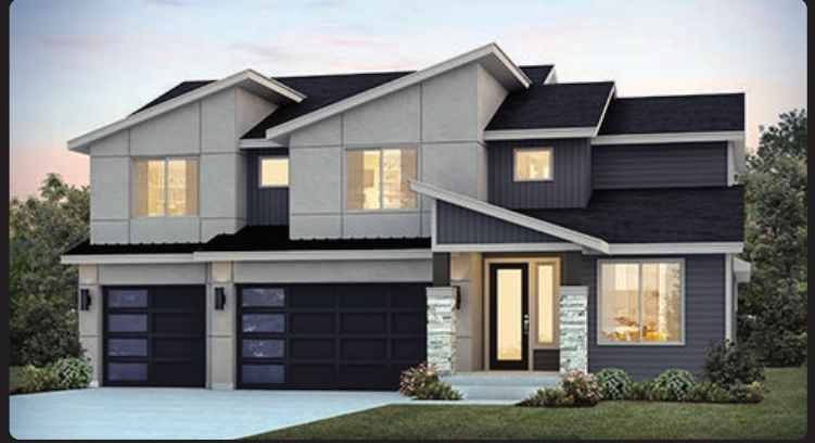
Elevation B - MODERN