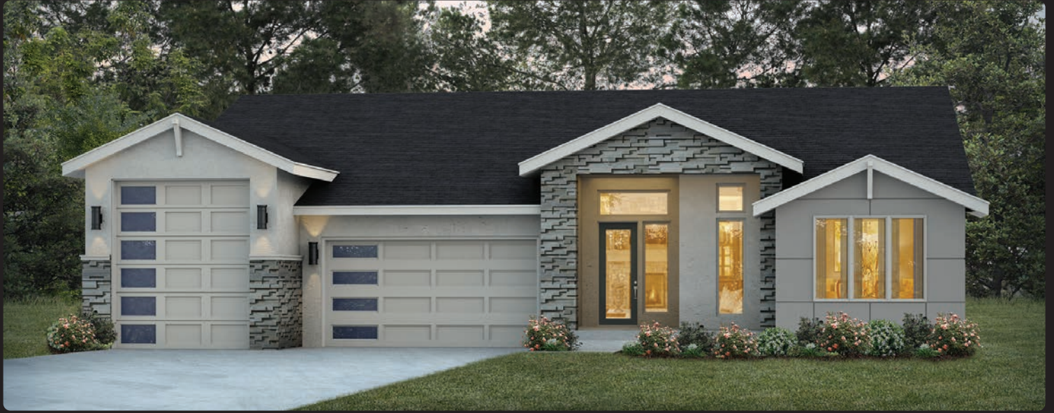
Elevation B - MODERN

3 Beds / Kids Flex Space / Office / 2.5 Baths / 2 Car + RV Garage