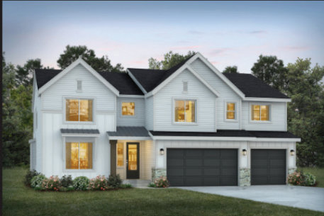
Elevation A Modern Farmhouse

5 Bedrooms includes Den/Guest | Bonus Loft | 2.75 Baths | Covered Outdoor Living | 3 Car Garage