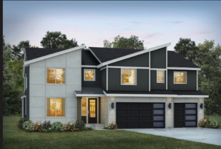
Elevation B Modern Farmhouse