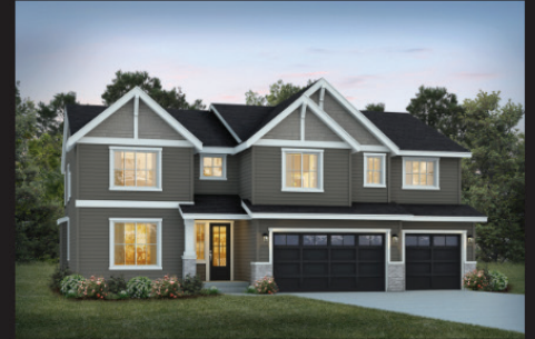
Elevation C Craftsman