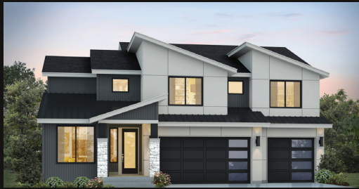
Elevation B FULL MODERN