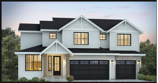
Elevation C CRAFTSMAN