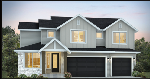
Elevation A MODERN FARMHOUSE

4 Bedroom | Primary on Main | 2.75 Baths | Office/Guest | Leisure Loft | 3 Car Garage