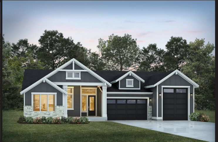
Elevation C - CRAFTSMAN