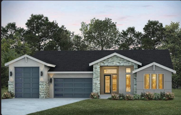
Elevation B - FULL MODERN

3 Bedrooms | Opt. 4th Bedroom w/Den - Flex Space | 2.5 Baths | 2 Car + RV Garage