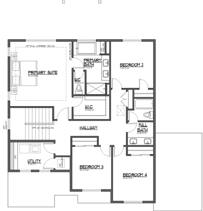
MASTER PLAN 10/12/2023 COBALT