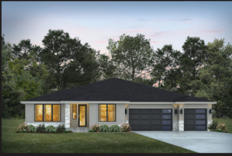
B Elevation Full Modern - Stucco