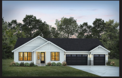
C Elevation Craftsman