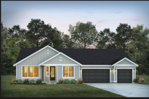
A Elevation NW Farmhouse

4 Bedrooms | 2.75 Bathrooms | Office | 3 Car Garage