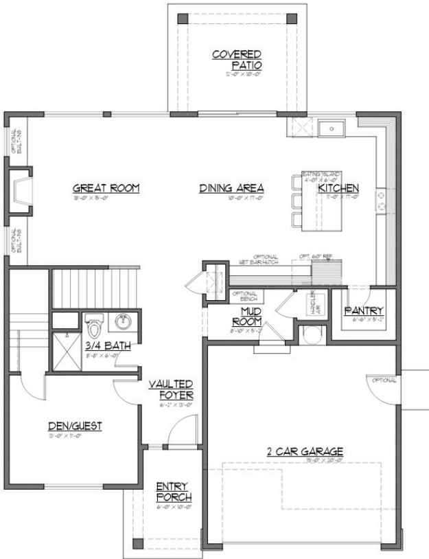
MASTER PLAN 7/13/2023