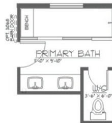
Optional Primary Bath