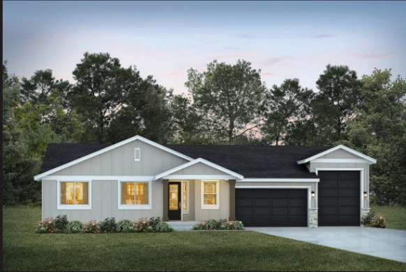
Elevation A Modern Farmhouse

Rambler | 3 Bedrooms | Office Alcove | 2 Baths | Covered Outdoor Living | 2 Car + RV Garage