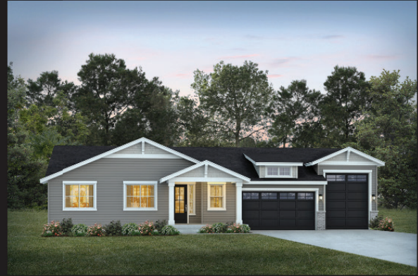
Elevation C Craftsman