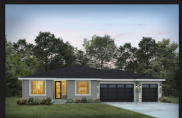
Elevation D Transitional