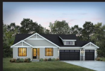
Elevation C Craftsman