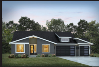
Elevation B Modern