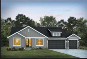
Elevation A Modern Farmhouse

Rambler | 4 Bedrooms includes Den/Guest | 2.5 Bathrooms | Covered Outdoor Living | 3 Car Garage