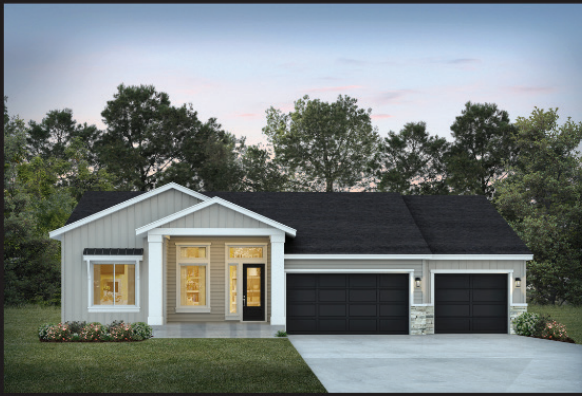
Elevation A Modern Farmhouse

Rambler | 3 Bedrooms | 2.5 Bathrooms | Butler Pantry | 3 Car Garage