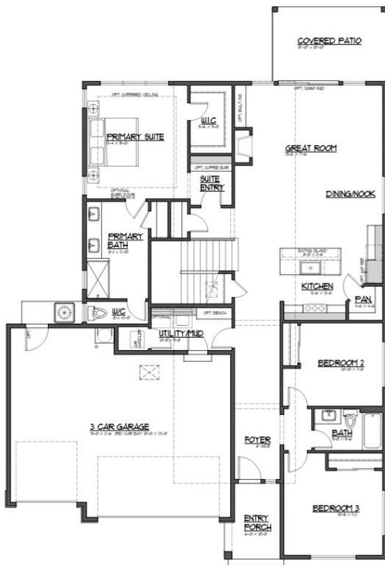
MASTER PLAN 11/14/2023