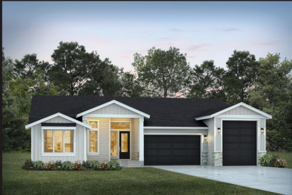
Elevation A Modern Farmhouse

Rambler | 4 Bedrooms includes Den/Flex | 2.5 Baths | Covered Outdoor Living | 2 Car + RV Garage