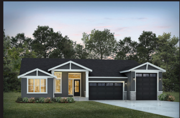
Elevation C Craftsman