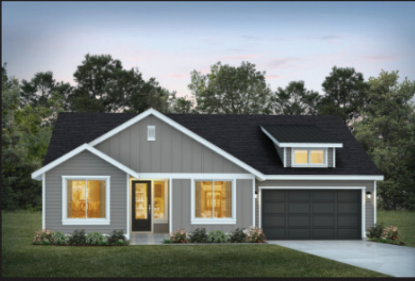
Elevation A Modern Farmhouse

Rambler | 3 Bedrooms | Den/Guest | 2.5 Bathrooms | Covered Outdoor Living | 2 Car Garage