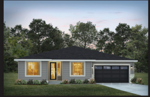
Elevation D Transitional