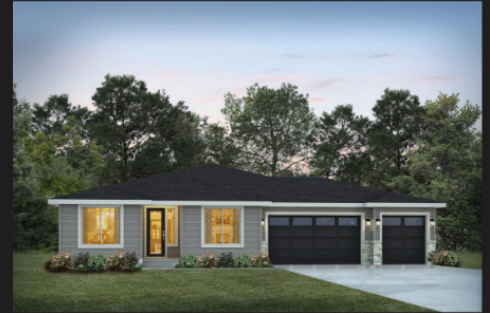
Elevation D Transitional