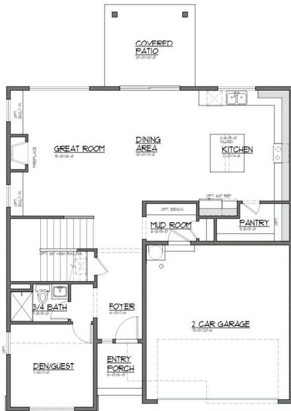
MASTER PLAN 10/25/2023